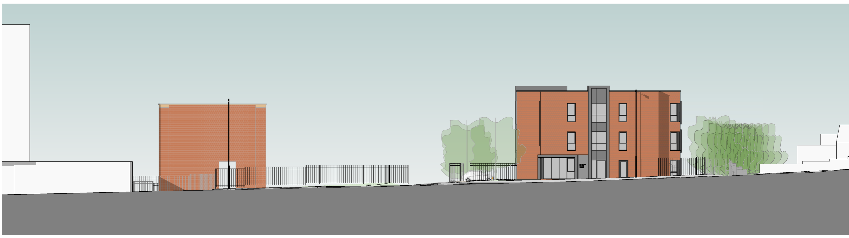
Front Elevation - Facing Castle Street 1 : 200