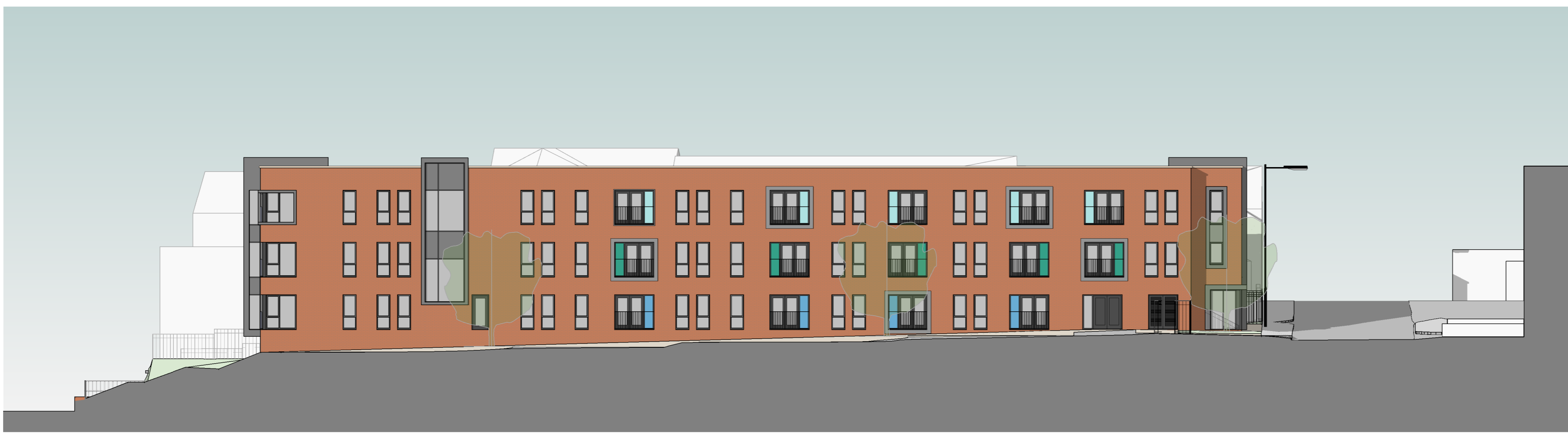
Side Elevation - Facing the car park & Pattern House 1 : 200