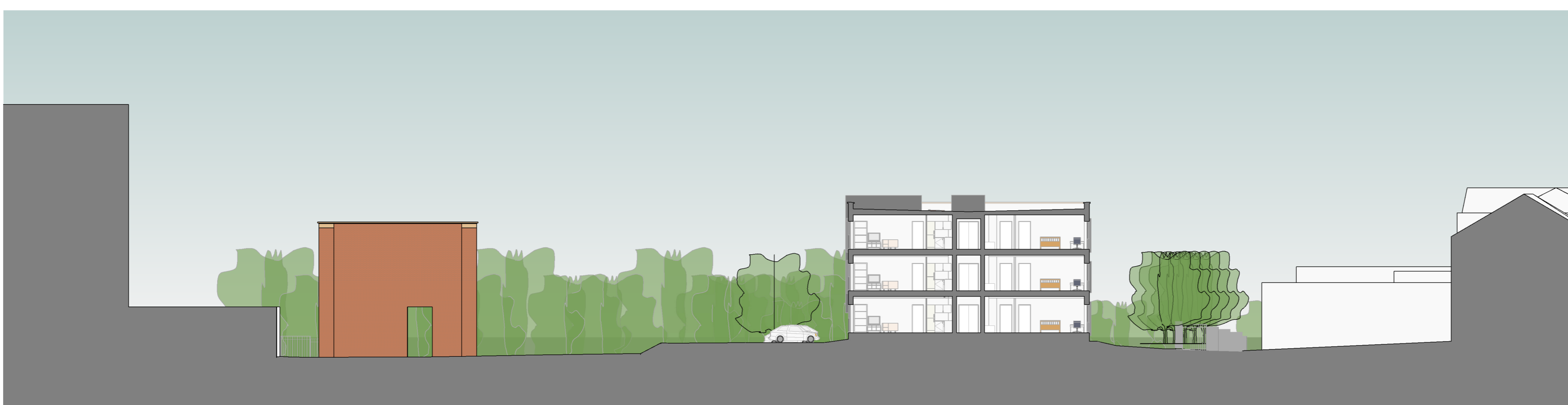
Section through the Pattern House, the proposed building and 17 Melbourne Street 1 : 250