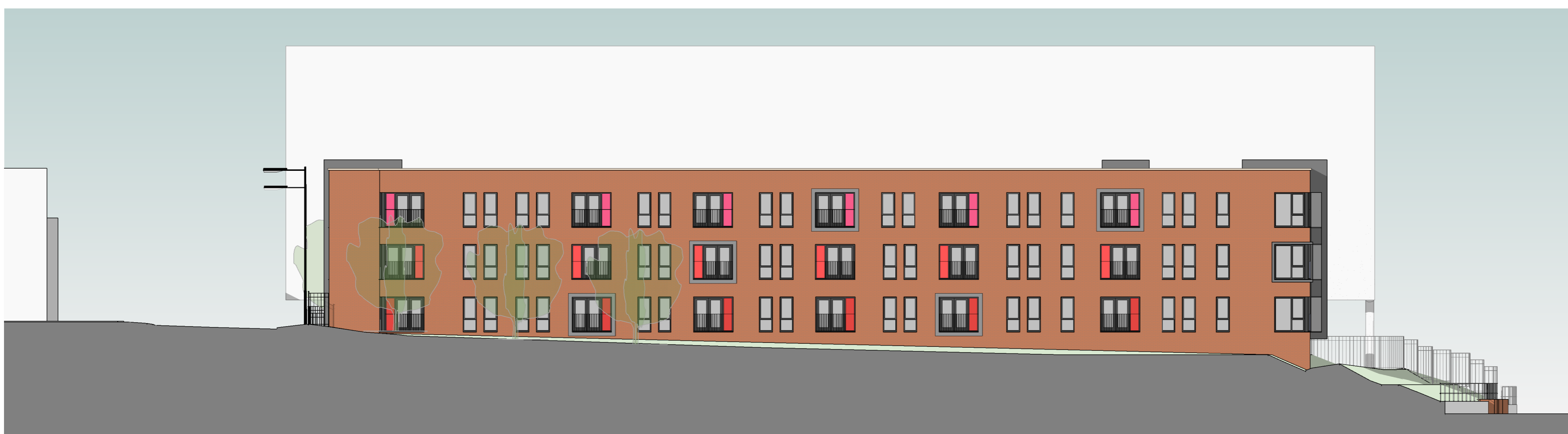
Side Elevation - Facing the garden and rear of the properties on Melbourne Street 1 : 200