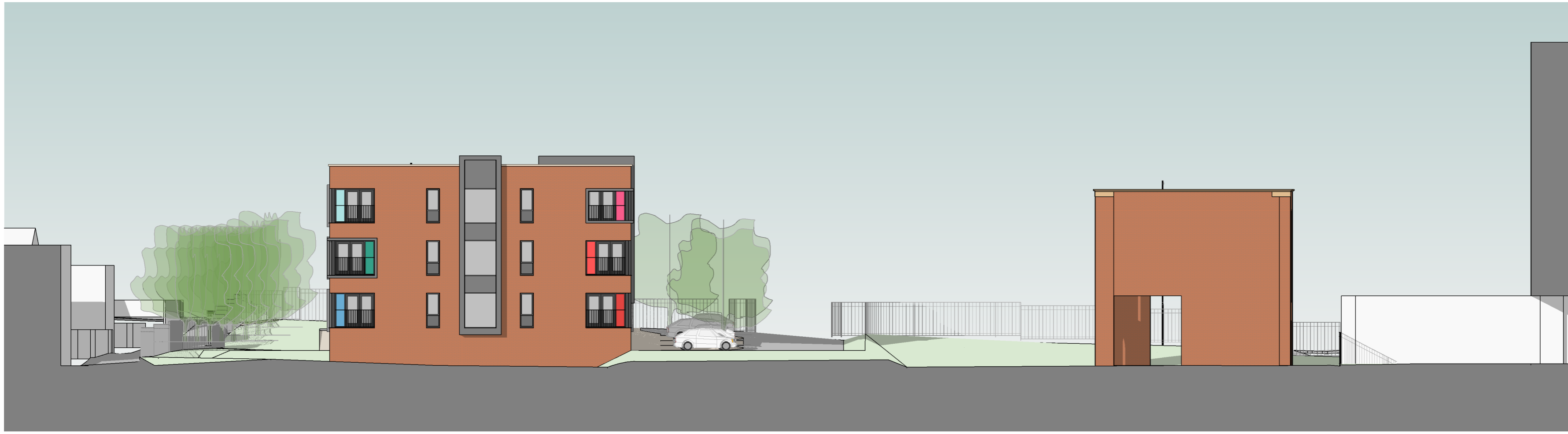
End Elevation - Facing the River Tame 1 : 200