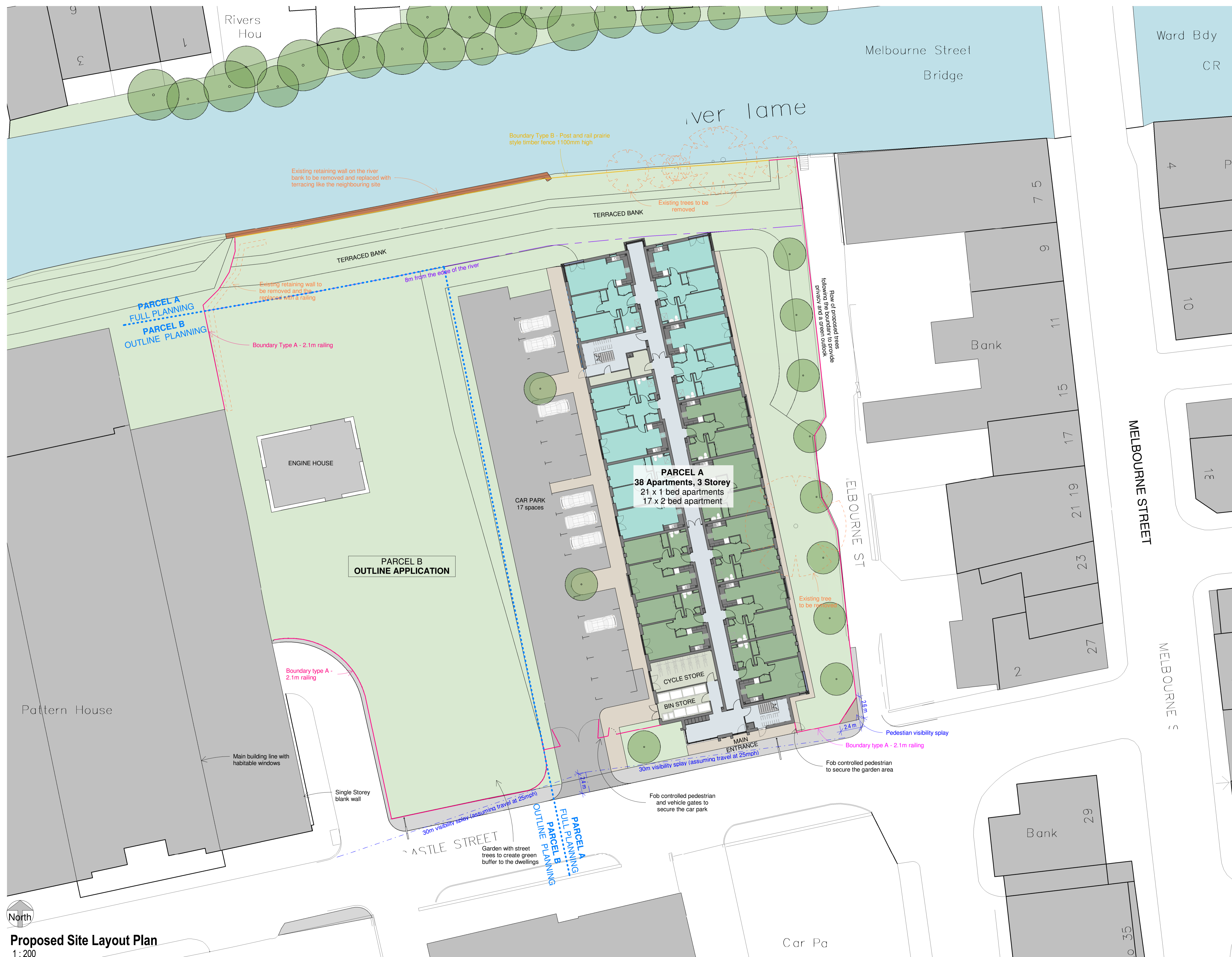
Proposed Site Layout Plan 1:200

Notes The Contractor is to check all dimensions and conditions on site before commencing. Do not scale from this drawing. This drawing remains the copyright of POZZONI Architecture Ltd.